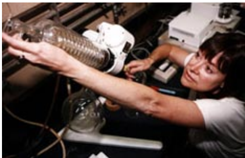
$3.5 million NSF Grant awarded