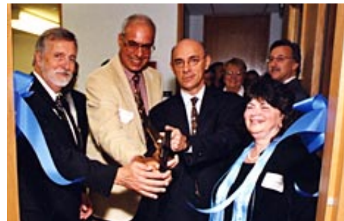
Opening of new pre-law home