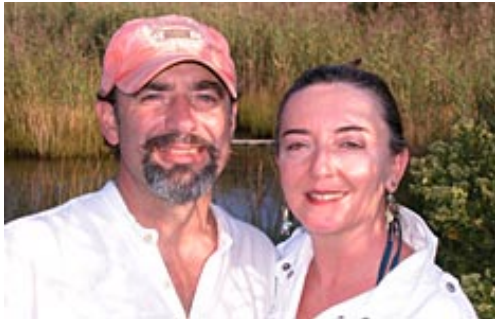
Winter Gala Co-Chairs