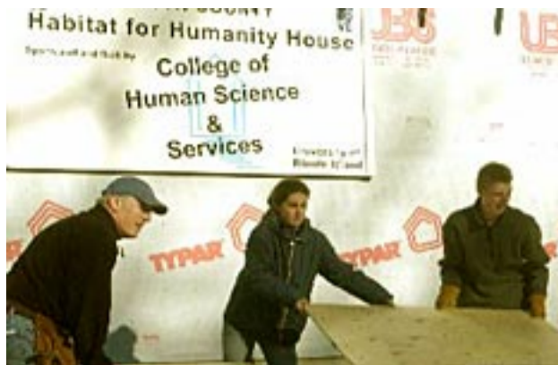
Raising the Roof