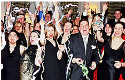
Young Alumni Weekend wrap-up