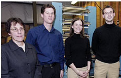
MBA students help start-ups